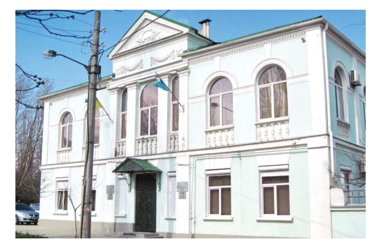
Former building of Mejlis in Crimea that was confiscated by the Russian authorities

tion, assembly and expression, with bans on public gatherings to commemorate culturally significant dates<sup>97</sup>, closure of independent Crimean Tatar media outlets<sup>98</sup>, as well as other societies and organizations<sup>99</sup>.