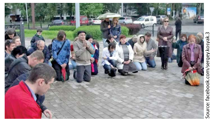
In March 2014 representatives of 60 churches of different denominations in Donetsk united to set up a daily Prayer Marathon

pro-Russian fighters immediately after the assault. He was detained and brutally beaten, allegedly for his pro-Ukrainian stance. Marathon was allowed to take place, on the condition that there was no mention of Ukraine as a nation<sup>50</sup>.