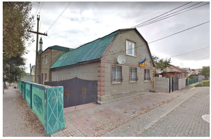
Premises of islamic centre and al-Amal mosque in Donetsk were raided on June 28, 2018

Muslims in Donbas region also fall victim to religious persecution. On June 28, 2018, representatives of the so-called Ministry of State Security of the The Donetsk People's Republic raided the al-Amal